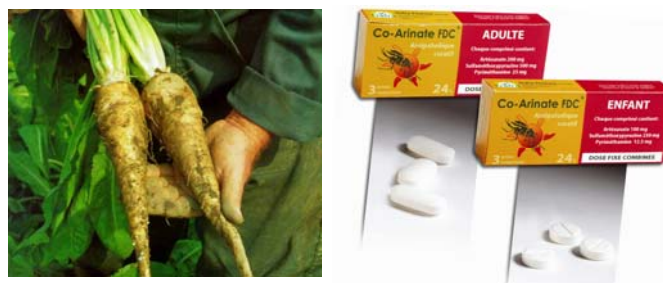
Fig. 2. Inulin chicory (left), a crop highly adapted to industrial production and processing, a new source for anti-malarial Artemisinin based Combination Therapies (ACTs).

We have chosen inulin chicory as artemisinin production platform because it is a well-established industrial crop for a.o. non-food applications. This means that the entire chain of large-scale agricultural production, including extraction, is already operational. Dafra Pharma International NV has the chemical expertise required for the conversion, after extraction, of the precursor into artemisinin that is directly suitable for the production of ACTs.